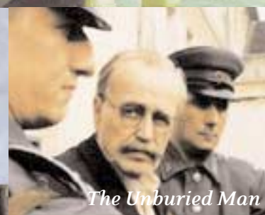
The Unburied Man